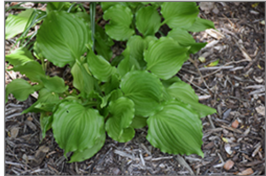
Bridegroom Hosta

The sculpted shiny green leaves of this variety twist upward for a very unique form; also very attractive are the rippled edges and the darker lavender flowers that appear mid-summer; provides an amazing garden texture