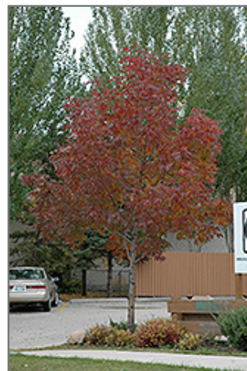
Northern Blaze White Ash in fall