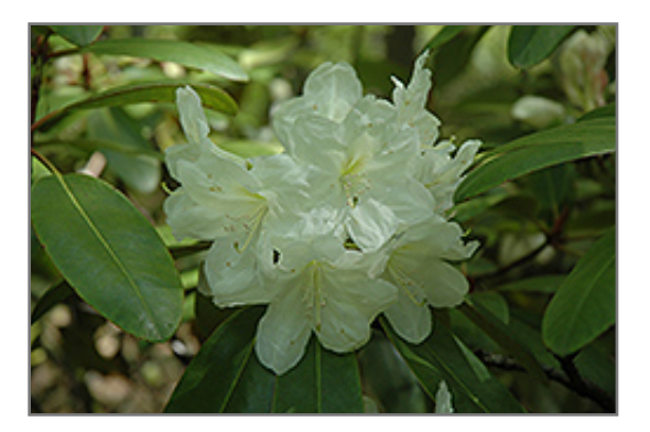
Ivory Tower Rhododendron flowers