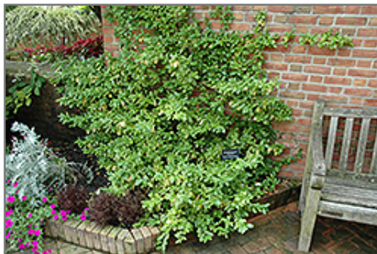
Sarcoxie Wintercreeper