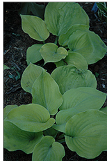
Lemon Meringue Hosta foliage