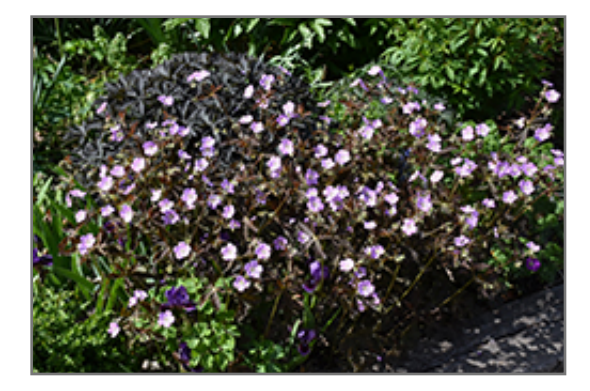
Elizabeth Ann Cranesbill in bloom