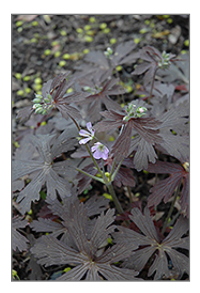
Elizabeth Ann Cranesbill flowers