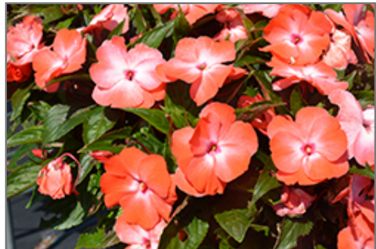
Petticoat Orange Orchid New Guinea Impatiens flowers