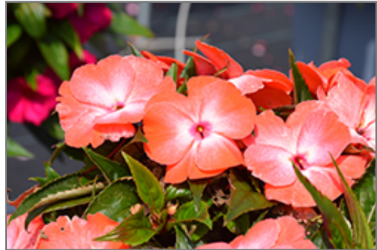
Petticoat Orange Orchid New Guinea Impatiens flowers

Petticoat Orange Orchid New Guinea Impatiens is recommended for the following landscape applications;