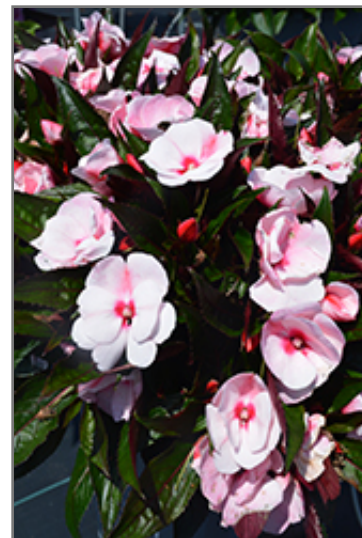
Petticoat Cherry Blossom New Guinea Impatiens flowers

This plant will require occasional maintenance and upkeep, and should not require much pruning, except when necessary, such as to remove dieback. It is a good choice for attracting bees, butterflies and hummingbirds to your yard. It has no significant negative characteristics.