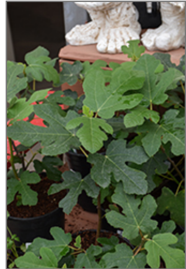
Fignomenal Dwarf Fig

Fignomenal Dwarf Fig has attractive dark green foliage with light green veins on a plant with an upright spreading habit of growth. The small lobed leaves are highly ornamental but do not develop any appreciable fall color. The fruits are showy dark brown pomes with plum purple overtones, which are carried in abundance from mid summer to late fall. The fruit can be messy if allowed to drop on the lawn or walkways, and may require occasional clean-up.