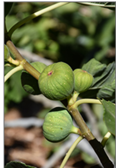
Fignomenal Dwarf Fig fruit