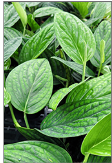
Green Galaxy Philodendron foliage

When grown indoors, Green Galaxy Philodendron can be expected to grow to be about 18 inches tall at maturity, with a spread of 6 feet. It grows at a fast rate, and under ideal conditions can be expected to live for approximately 10 years. This houseplant performs well in both bright or indirect sunlight and strong artificial light, and can therefore be situated in almost any well-lit room or location. It does best in average to evenly moist soil, but will not tolerate standing water. The surface of the soil shouldn't be allowed to dry out completely, and so you should expect to water this plant once and possibly even twice each week. Be aware that your particular watering schedule may vary depending on its location in the room, the pot size, plant size and other conditions; if in doubt, ask one of our experts in the store for advice. It will benefit from a regular feeding with a general-purpose fertilizer with every second or third watering. It is not particular as to soil type or pH; an average potting soil should work just fine. Be warned that parts of this plant are known to be toxic to humans and animals, so special care should be exercised if growing it around children and pets.