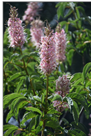
Canyon Pink California Buckeye flowers

Canyon Pink California Buckeye is a multi-stemmed deciduous tree with a more or less rounded form. Its average texture blends into the landscape, but can be balanced by one or two finer or coarser trees or shrubs for an effective composition.