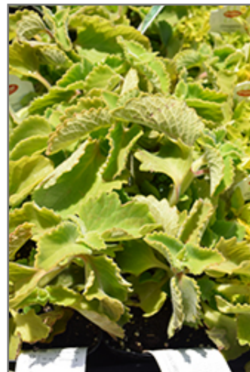
Mexican Mint foliage