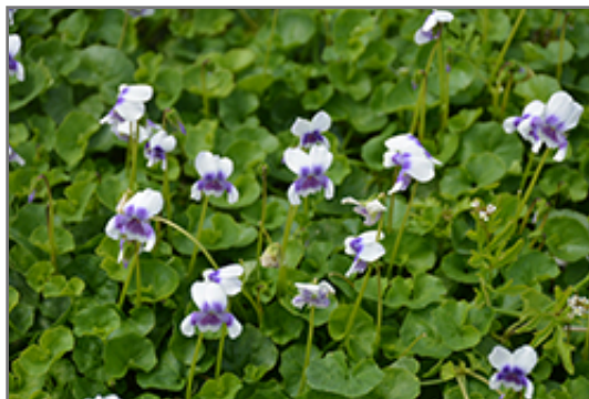
Australian Violet flowers

Australian Violet is recommended for the following landscape applications;