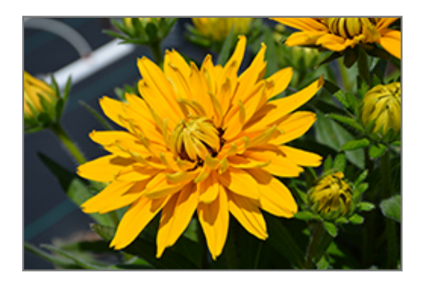
Sunbeckia Lucia Coneflower flowers