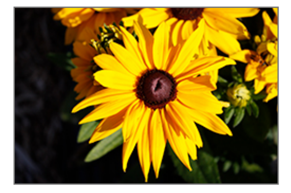
Sunbeckia Lucia Coneflower flowers

Sunbeckia Lucia Coneflower is recommended for the following landscape applications;