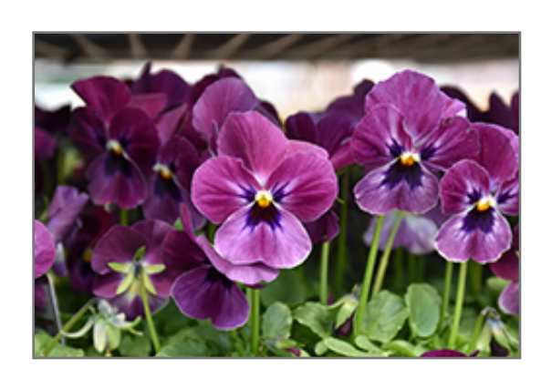
Sorbet XP Raspberry Pansy flowers