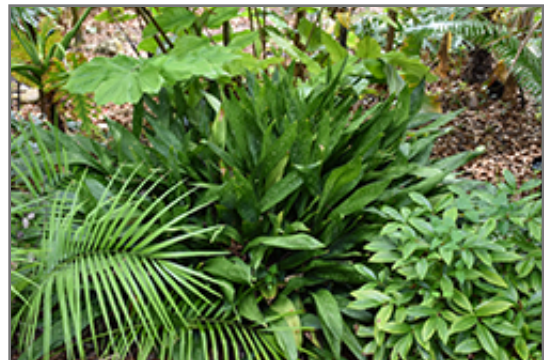
Galaxy Cast Iron Plant