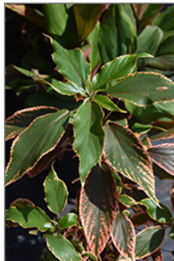
Bourbon Street Copper Plant foliage

This is a multi-stemmed evergreen houseplant with an upright spreading habit of growth. This plant may benefit from an occasional pruning to look its best.