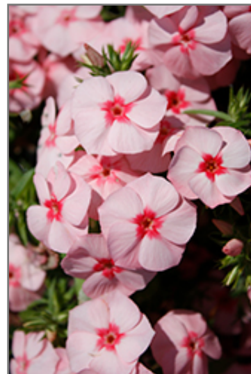
Gisele Light Pink+Eye Phlox flowers

Gisele Light Pink+Eye Phlox is recommended for the following landscape applications;