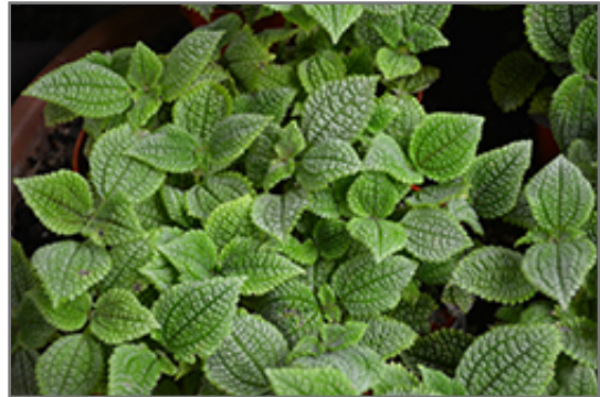
Moon Valley Pilea foliage

Moon Valley Pilea is recommended for the following landscape applications;