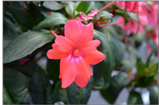
Solarscape XL Salmon Glow Impatiens flowers

Solarscape XL Salmon Glow Impatiens will grow to be about 11 inches tall at maturity, with a spread of 20 inches. When grown in masses or used as a bedding plant, individual plants should be spaced approximately 14 inches apart. Its foliage tends to remain low and dense right to the ground. This fast-growing annual will normally live for one full growing season, needing replacement the following year.