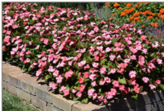
Solarscape XL Salmon Glow Impatiens in bloom