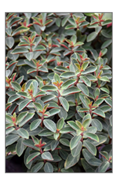
Red Log Peperomia foliage

When grown indoors, Red Log Peperomia can be expected to grow to be about 12 inches tall at maturity, with a spread of 18 inches. It grows at a slow rate, and under ideal conditions can be expected to live for approximately 5 years. This houseplant should only be grown away from direct sunlight or in a room with strong artificial light. It does best in average to evenly moist soil, but will not tolerate standing water. The surface of the soil shouldn't be allowed to dry out completely, and so you should expect to water this plant once and possibly even twice each week. Be aware that your particular watering schedule may vary depending on its location in the room, the pot size, plant size and other conditions; if in doubt, ask one of our experts in the store for advice. It will benefit from a regular feeding with a general-purpose fertilizer with every second or third watering. It is not particular as to soil type or pH; an average potting soil should work just fine.