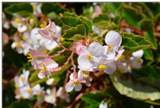
Hula Blush Begonia flowers

This is a high maintenance plant that will require regular care and upkeep, and usually looks its best without pruning, although it will tolerate pruning. Deer don't particularly care for this plant and will usually leave it alone in favor of tastier treats. Gardeners should be aware of the following characteristic(s) that may warrant special consideration;