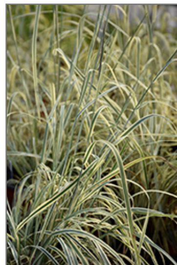
Shining Star Bluestem foliage

Shining Star Bluestem is recommended for the following landscape applications;