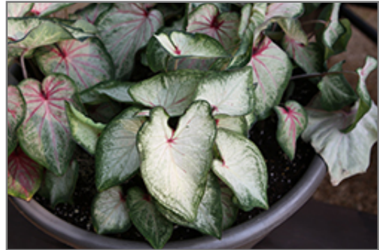
Heart to Heart White Star Caladium foliage

When grown indoors, Heart to Heart White Star Caladium can be expected to grow to be about 18 inches tall at maturity, with a spread of 10 inches. It grows at a medium rate, and under ideal conditions can be expected to live for approximately 10 years. This houseplant performs well in both bright or indirect sunlight and strong artificial light, and can therefore be situated in almost any well-lit room or location. It prefers to grow in average to moist soil. The surface of the soil shouldn't be allowed to dry out completely, and so you should expect to water this plant once and possibly even twice each week. Be aware that your particular watering schedule may vary depending on its location in the room, the pot size, plant size and other conditions; if in doubt, ask one of our experts in the store for advice. It is not particular as to soil type or pH; an average potting soil should work just fine.