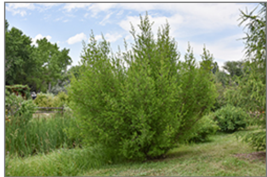
New Mexico Privet

This shrub will require occasional maintenance and upkeep, and is best pruned in late winter once the threat of extreme cold has passed. It is a good choice for attracting birds and bees to your yard. Gardeners should be aware of the following characteristic(s) that may warrant special consideration;