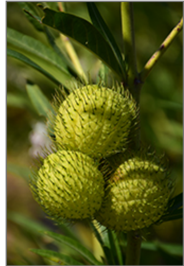
Balloon Plant fruit

Balloon Plant is a dense herbaceous perennial with an upright spreading habit of growth. Its medium texture blends into the garden, but can always be balanced by a couple of finer or coarser plants for an effective composition.