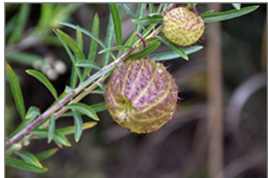
Balloon Plant fruit