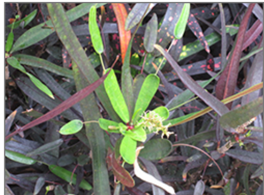
Mother And Daughter Croton flowers