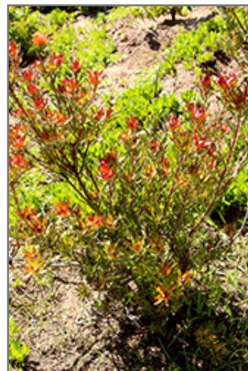
Safari Sunrise Conebush in spring