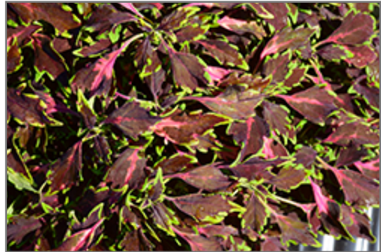
PartyTime Red Bolero Coleus foliage

PartyTime Red Bolero Coleus is recommended for the following landscape applications;