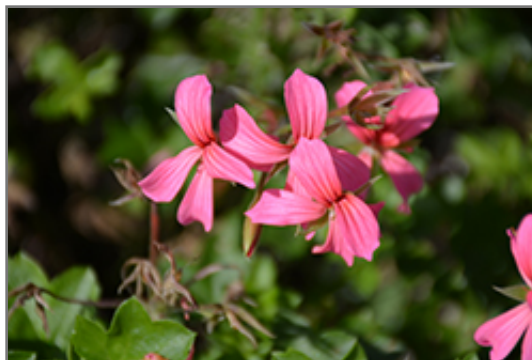
Minicascade Pink Ivy Leaf Geranium flowers

This plant will require occasional maintenance and upkeep. Trim off the flower heads after they fade and die to encourage more blooms late into the season. It is a good choice for attracting bees and butterflies to your yard. It has no significant negative characteristics.