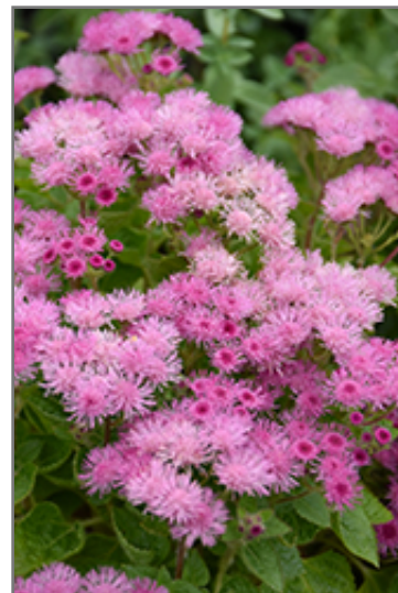
Bumble Rose Flossflower flowers

Bumble Rose Flossflower is recommended for the following landscape applications;