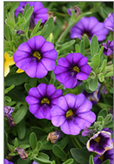
Cabrio Amethyst Calibrachoa flowers