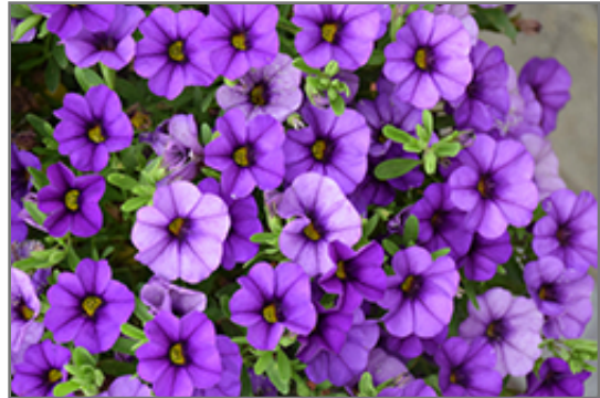
Cabrio Amethyst Calibrachoa flowers

This plant will require occasional maintenance and upkeep. Trim off the flower heads after they fade and die to encourage more blooms late into the season. It is a good choice for attracting bees and hummingbirds to your yard, but is not particularly attractive to deer who tend to leave it alone in favor of tastier treats. It has no significant negative characteristics.