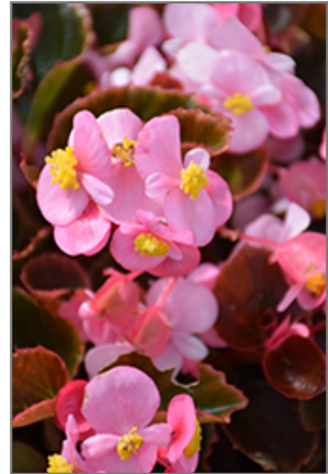
Cocktail Brandy Begonia flowers

Cocktail Brandy Begonia is an herbaceous annual with a mounded form. Its medium texture blends into the garden, but can always be balanced by a couple of finer or coarser plants for an effective composition.