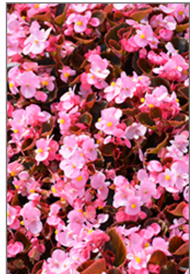
Cocktail Brandy Begonia flowers