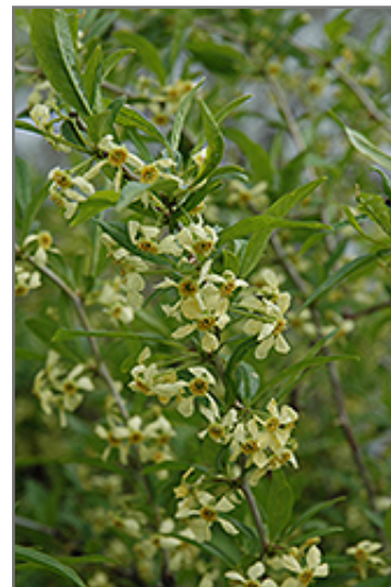
Cherry Prinsepia flowers

Cherry Prinsepia is recommended for the following landscape applications;