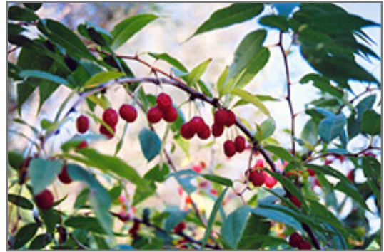
Cherry Prinsepia fruit

This shrub should only be grown in full sunlight. It is very adaptable to both dry and moist locations, and should do just fine under average home landscape conditions. It is not particular as to soil type or pH. It is highly tolerant of urban pollution and will even thrive in inner city environments. This species is not originally from North America.