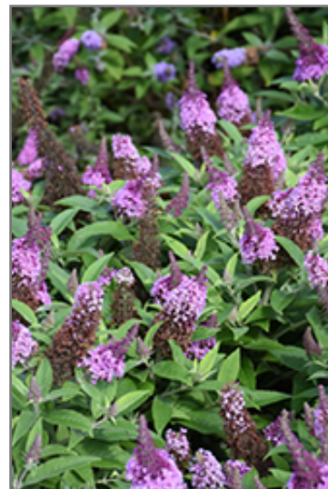
Chrysalis Pink Butterfly Bush flowers

Chrysalis Pink Butterfly Bush is recommended for the following landscape applications;