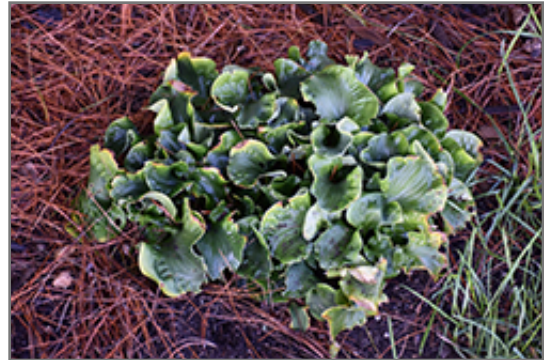
Church Mouse Hosta