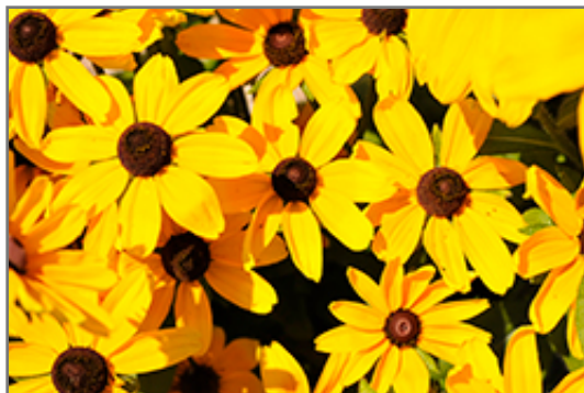
Cheyenne Gold Coneflower flowers

Cheyenne Gold Coneflower is recommended for the following landscape applications;