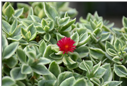
Variegated Baby Sun Rose flowers

Variegated Baby Sun Rose is recommended for the following landscape applications;