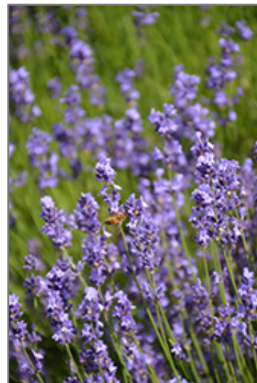
French Fields Lavender flowers

French Fields Lavender is recommended for the following landscape applications;