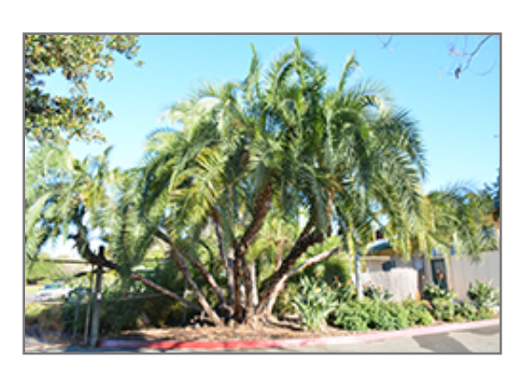
Senegal Date Palm