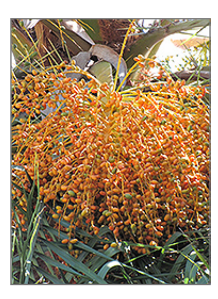
Senegal Date Palm fruit

Senegal Date Palm will grow to be about 50 feet tall at maturity, with a spread of 20 feet. It has a high canopy of foliage that sits well above the ground, and should not be planted underneath power lines. As it matures, the lower branches of this tree can be strategically removed to create a high enough canopy to support unobstructed human traffic underneath. It grows at a slow rate, and under ideal conditions can be expected to live for 60 years or more. This is a dioecious species, meaning that individual plants are either male or female. Only the females will produce fruit, and a male variety of the same species is required nearby as a pollinator.