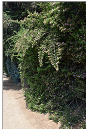
Crossberry in bloom

Crossberry is a good choice for the edible garden, but it is also well-suited for use in outdoor pots and containers. With its upright habit of growth, it is best suited for use as a 'thriller' in the 'spiller-thriller-filler' container combination; plant it near the center of the pot, surrounded by smaller plants and those that spill over the edges. It is even sizeable enough that it can be grown alone in a suitable container. Note that when grown in a container, it may not perform exactly as indicated on the tag - this is to be expected. Also note that when growing plants in outdoor containers and baskets, they may require more frequent waterings than they would in the yard or garden.