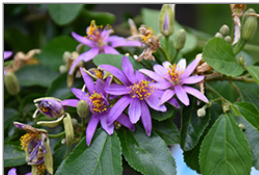
Crossberry flowers

Crossberry features showy lavender star-shaped flowers along the branches from early spring to early summer. It has dark green evergreen foliage. The serrated oval leaves remain dark green throughout the winter. It produces brick red berries from mid summer to early fall.