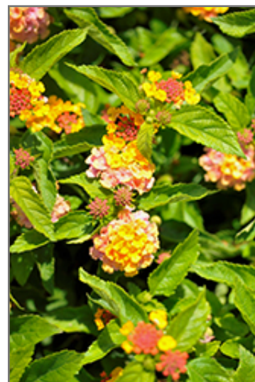
Gem Compact Rose Quartz Lantana flowers

Gem Compact Rose Quartz Lantana is recommended for the following landscape applications;