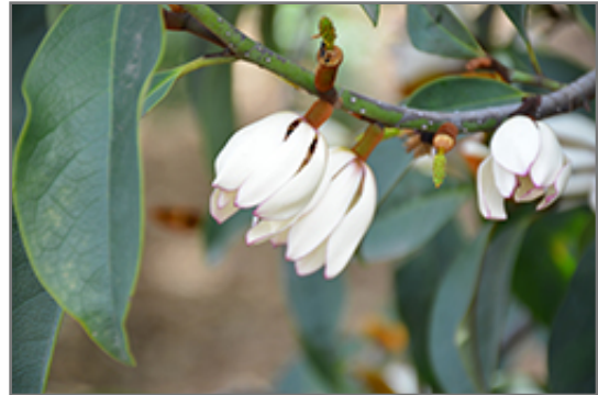
Fogg's #2 Magnolia flowers