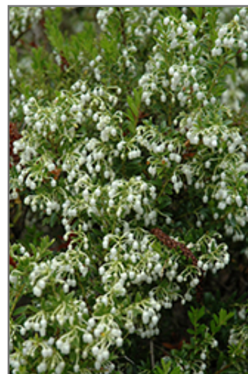
Chilean Wintergreen flowers

Chilean Wintergreen is recommended for the following landscape applications;