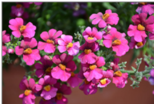
Nessie Plus Purple Nemesia flowers

Nessie Plus Purple Nemesia is recommended for the following landscape applications;