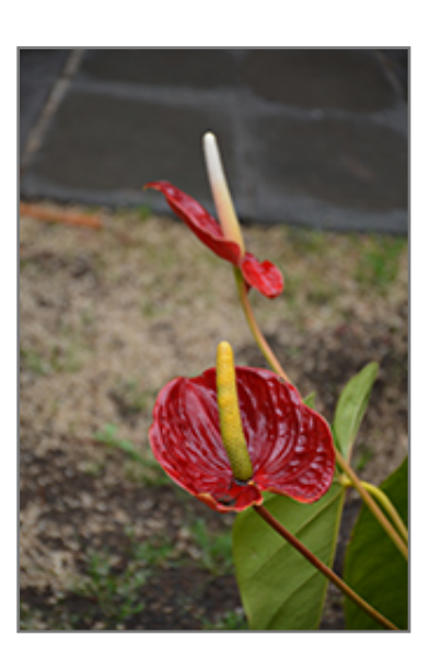
Calore Anthurium flowers

When grown indoors, Calore Anthurium can be expected to grow to be about 18 inches tall at maturity, with a spread of 12 inches. It grows at a medium rate, and under ideal conditions can be expected to live for approximately 5 years. This houseplant performs well in both bright or indirect sunlight and strong artificial light, and can therefore be situated in almost any well-lit room or location. It does best in average to evenly moist soil, but will not tolerate standing water. The surface of the soil shouldn't be allowed to dry out completely, and so you should expect to water this plant once and possibly even twice each week. Be aware that your particular watering schedule may vary depending on its location in the room, the pot size, plant size and other conditions; if in doubt, ask one of our experts in the store for advice. It is not particular as to soil type, but has a definite preference for acidic soil. Contact the store for specific recommendations on pre-mixed potting soil for this plant. Be warned that parts of this plant are known to be toxic to humans and animals, so special care should be exercised if growing it around children and pets.