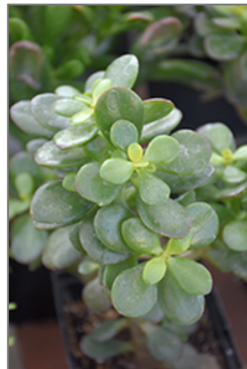
Baby Jade Plant foliage

This is a multi-stemmed evergreen houseplant with an upright spreading habit of growth. This plant can be pruned at any time to keep it looking its best.