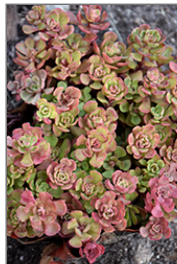
Pink Form Southern Stonecrop