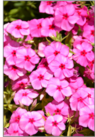
Gisele Pink Phlox flowers

Gisele Pink Phlox is a fine choice for the garden, but it is also a good selection for planting in outdoor containers and hanging baskets. It is often used as a 'filler' in the 'spiller-thriller-filler' container combination, providing a mass of flowers against which the thriller plants stand out. Note that when growing plants in outdoor containers and baskets, they may require more frequent waterings than they would in the yard or garden.