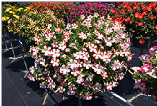
Amore King of Hearts Petunia in bloom

Amore King of Hearts Petunia will grow to be about 12 inches tall at maturity, with a spread of 14 inches. When grown in masses or used as a bedding plant, individual plants should be spaced approximately 10 inches apart. Its foliage tends to remain dense right to the ground, not requiring facer plants in front. This fast-growing annual will normally live for one full growing season, needing replacement the following year.